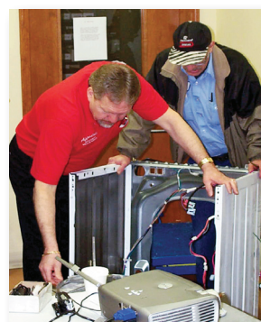
Training classes free with MSA membership.